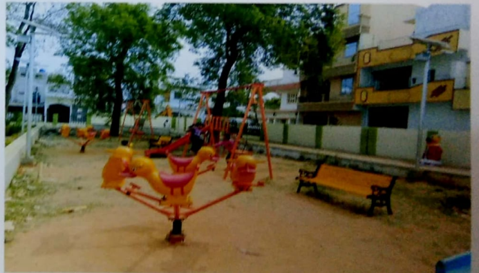
Darri Garden (16-17)